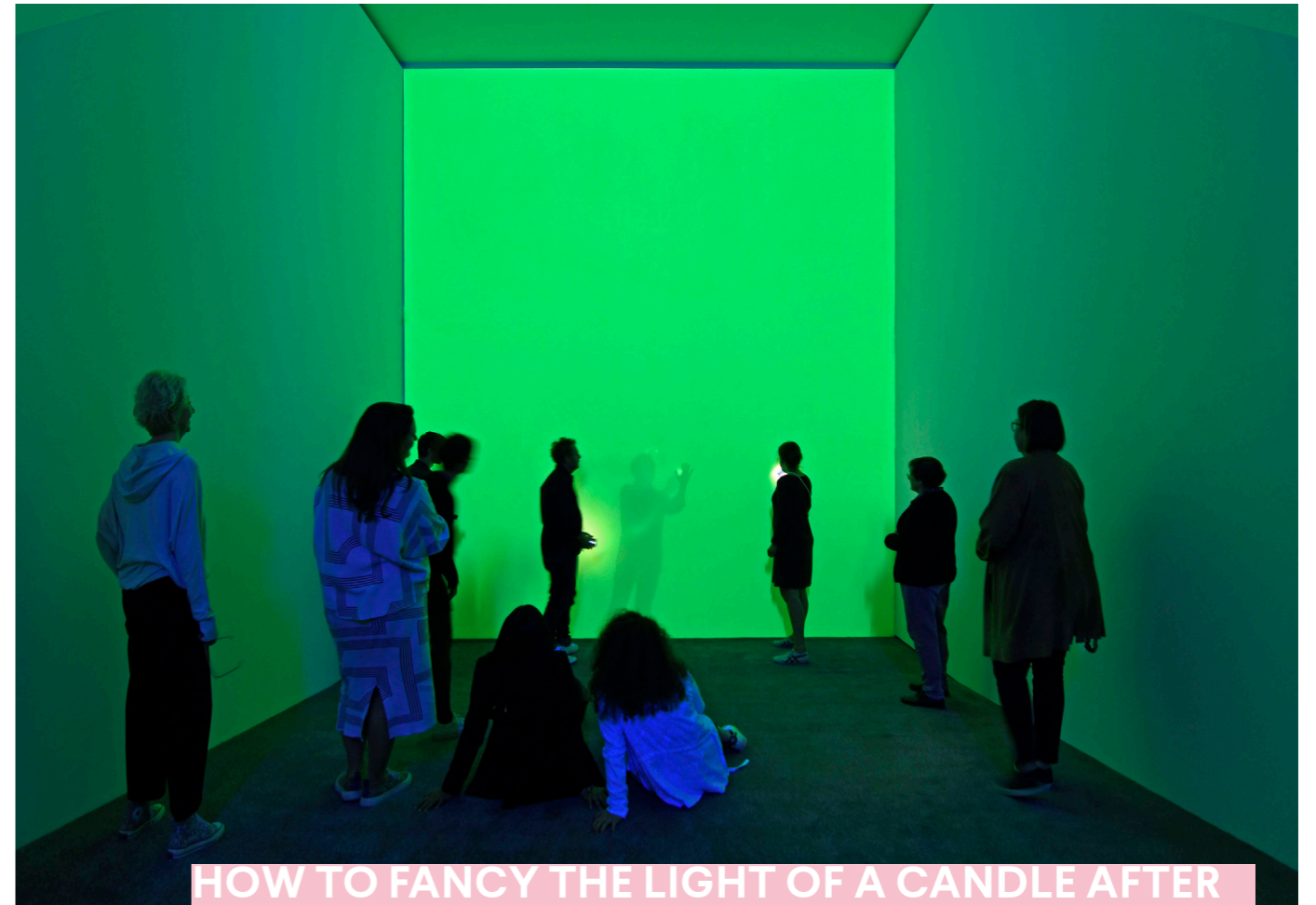
HOW TO FANCY THE LIGHT OF A CANDLE AFTER IT IS BLOWN OUT, 2019, Olaf Nicolai (DE)