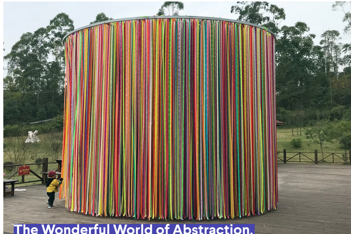
The Wonderful World of Abstraction, 2006, Jacob Dahlgren (SE)