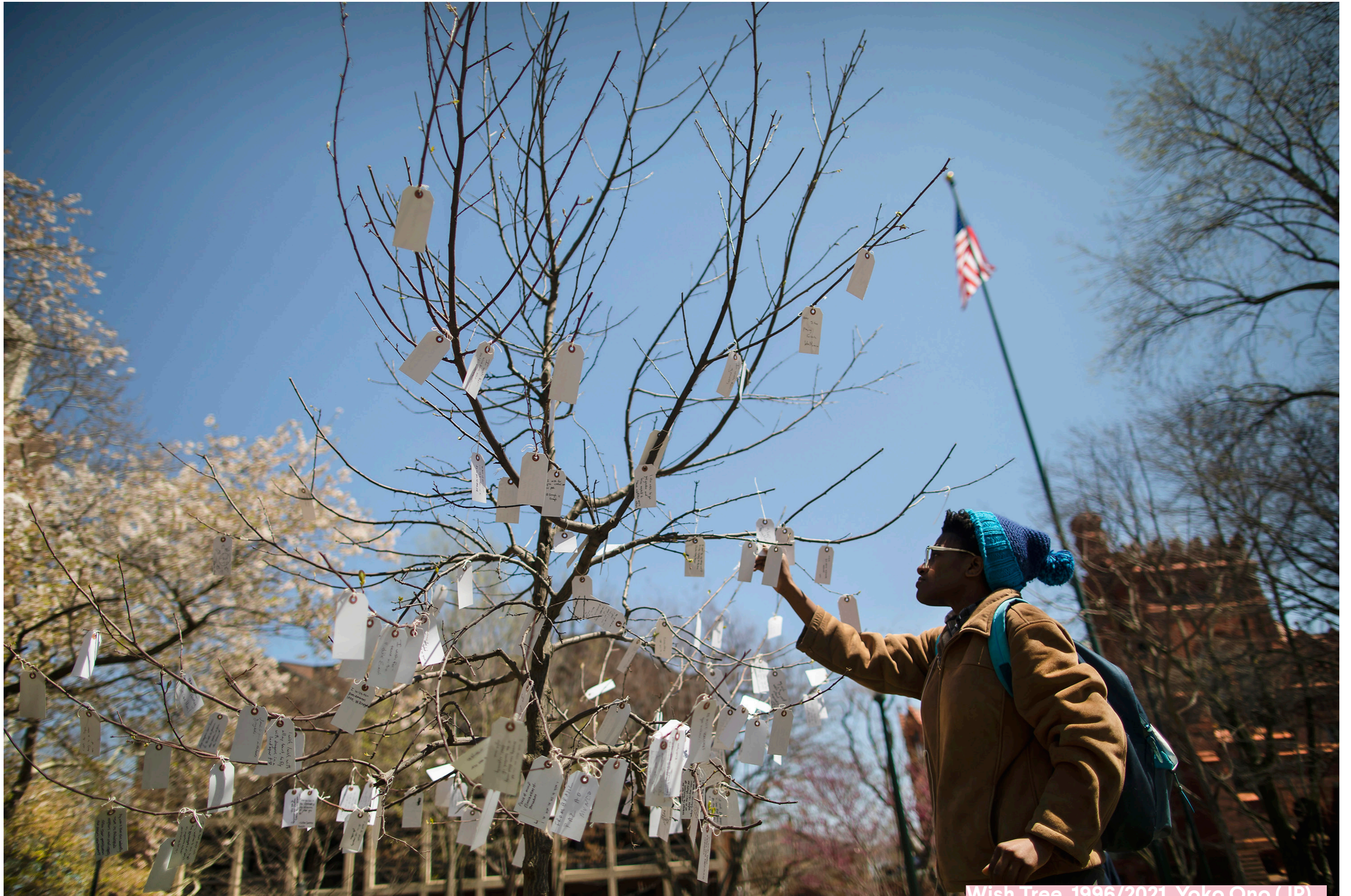
Wish Tree, 1996/2021, Yoko Ono (JP)