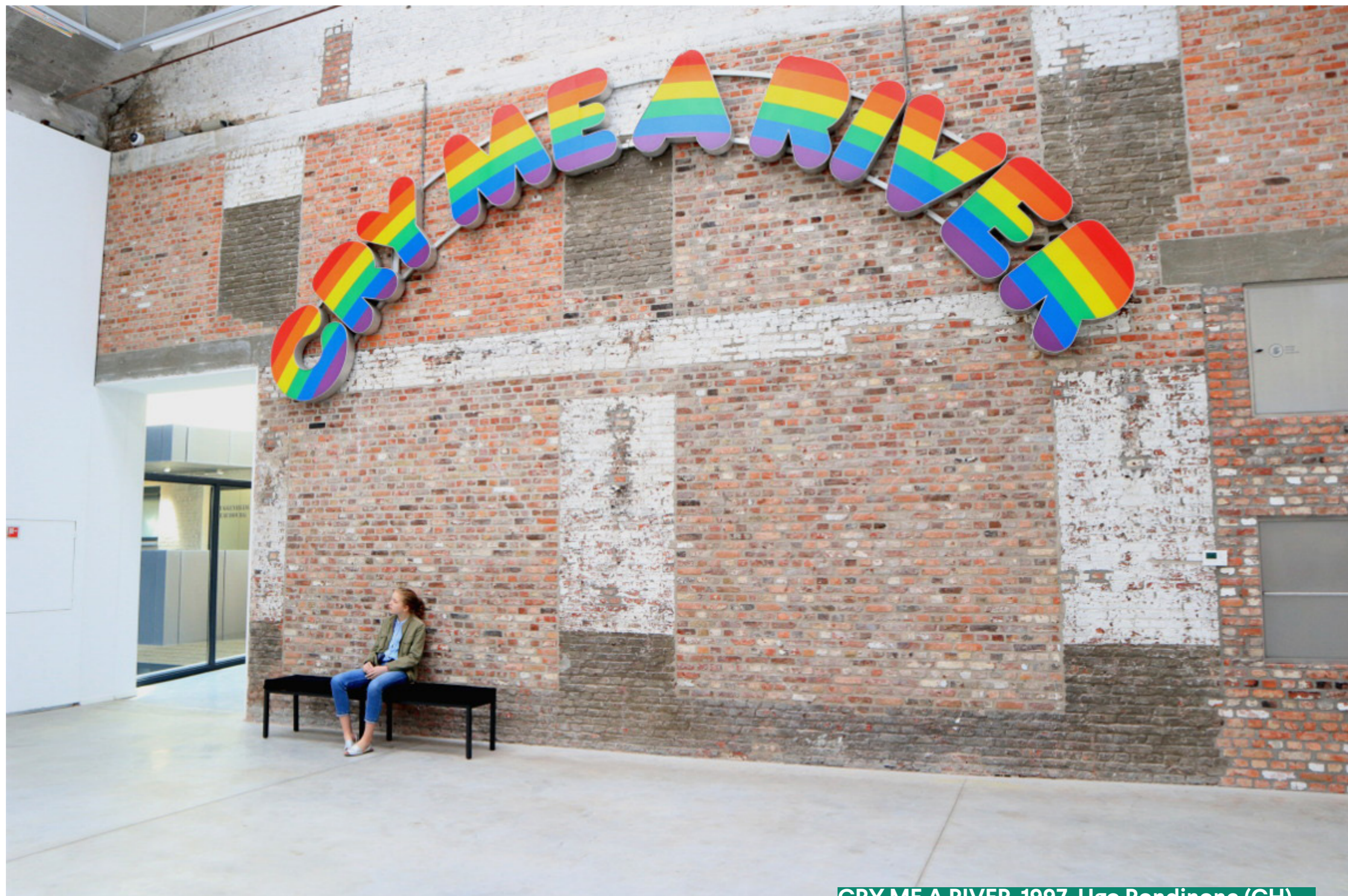
CRY ME A RIVER, 1997, Ugo Rondinone (CH)