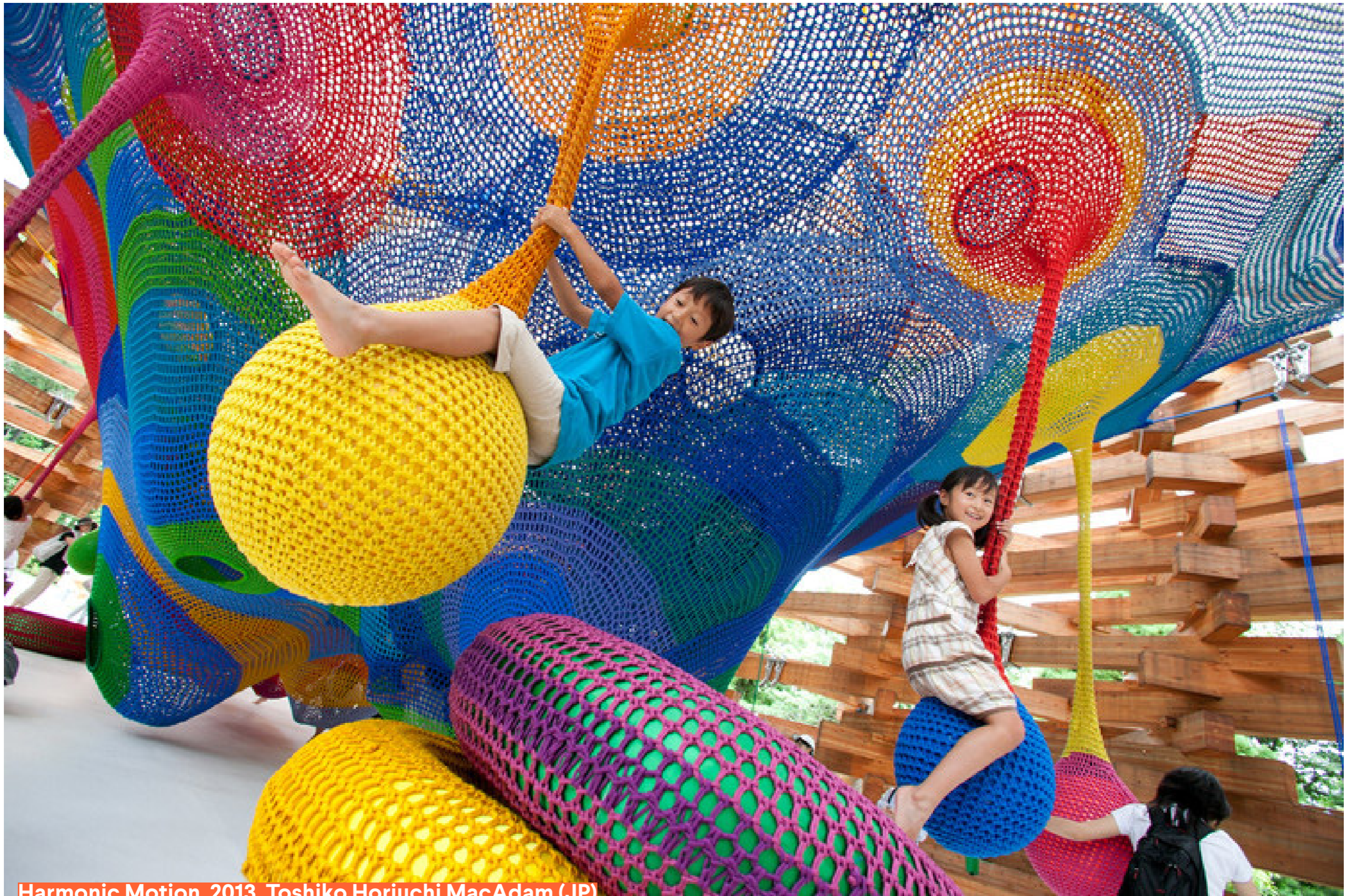
Harmonic Motion, 2013, Toshiko Horiuchi MacAdam (JP)